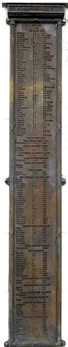
Pontypool Royal Naval Memorial