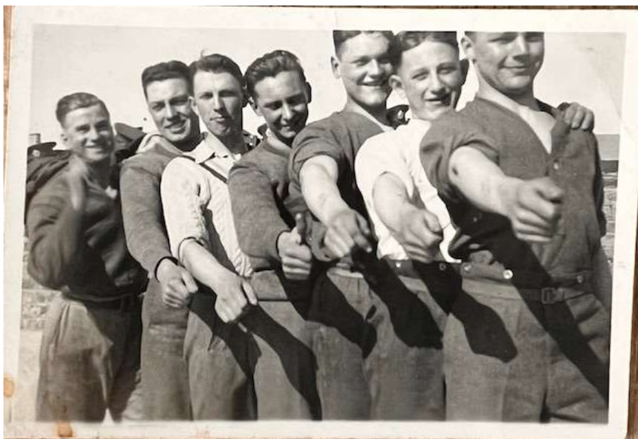
Chatham 1937 (3 rd from right)