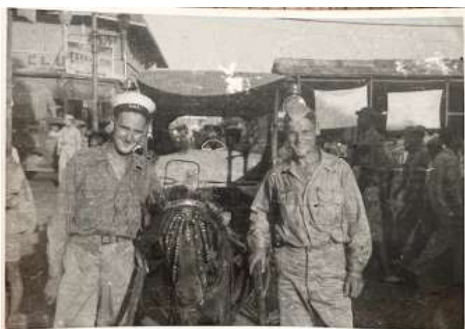
Repatriation – Manila 1945